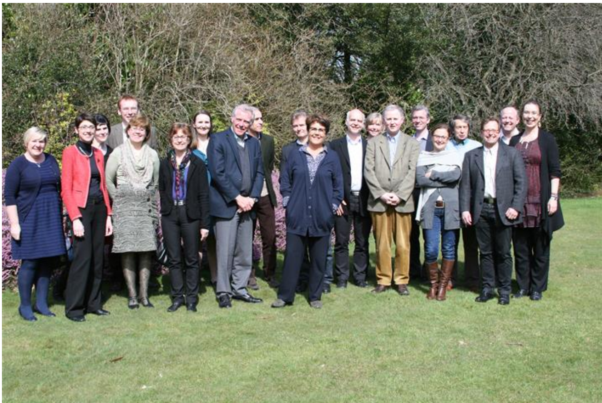
Group Photo from the ESADA network Meeting in Edinburgh, 2013