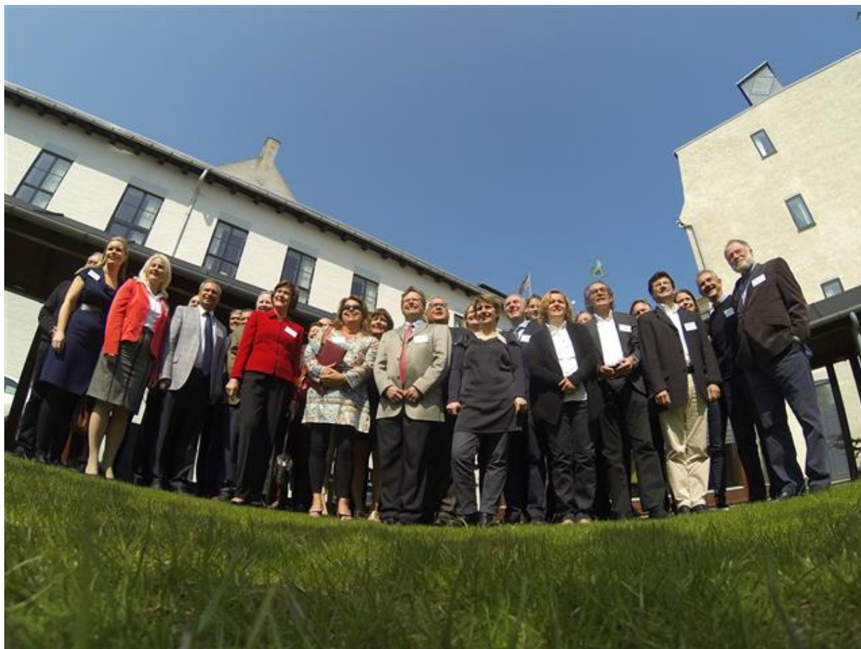
ANSS meeting in Copenhagen 2013